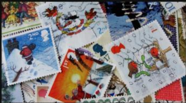
Image of a wide collection of assorted stamps spread randomly on a table.

Collect stamps for RNIB and make a difference to blind and partially sighted people.